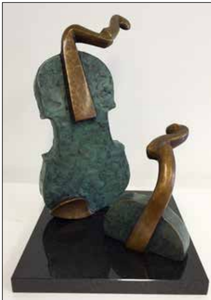
Jenny Green - Stradi-various 1 & 2