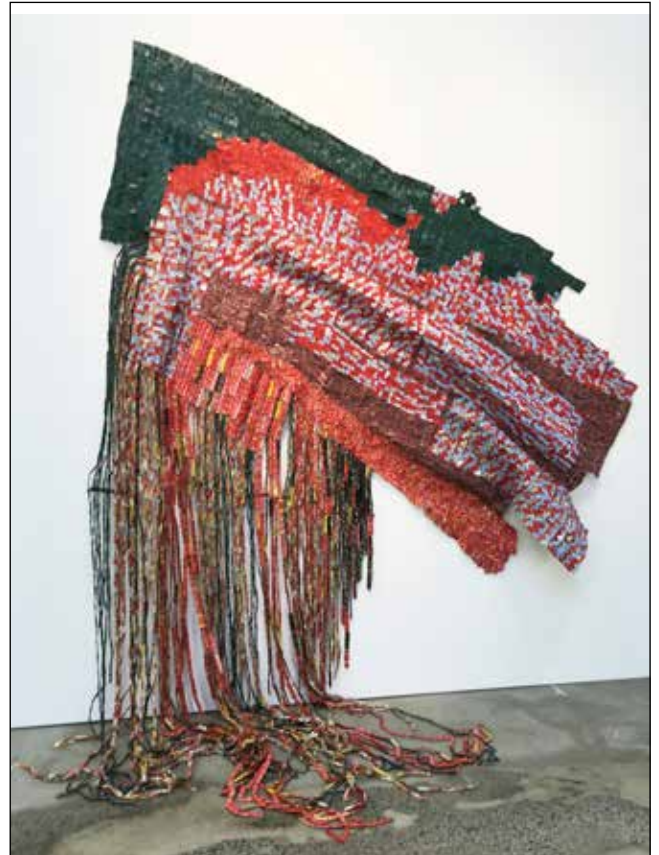
El Anatsui: Awakened 2012 Found Aluminium and copper wire

This was an exhibition not to be missed!