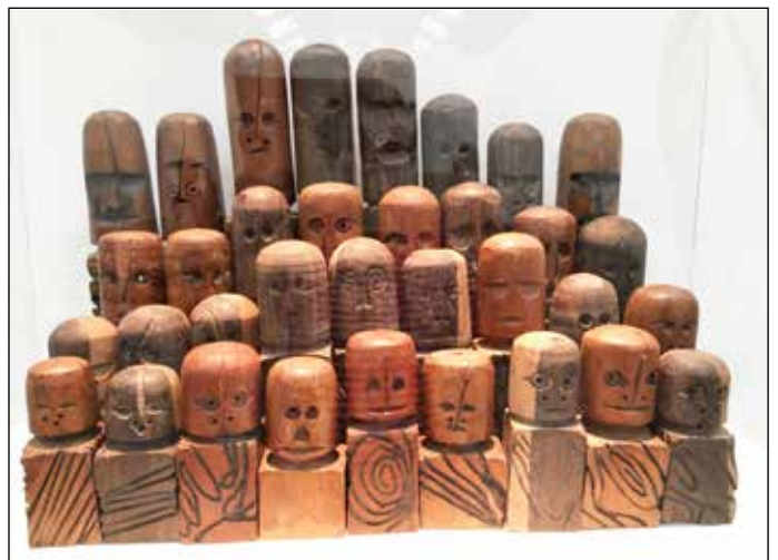
El Anatsui: Group Photo 1987 Ebony and Iroko woods