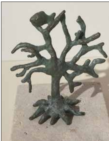
Masako Gordon: Under The Sea Bronze