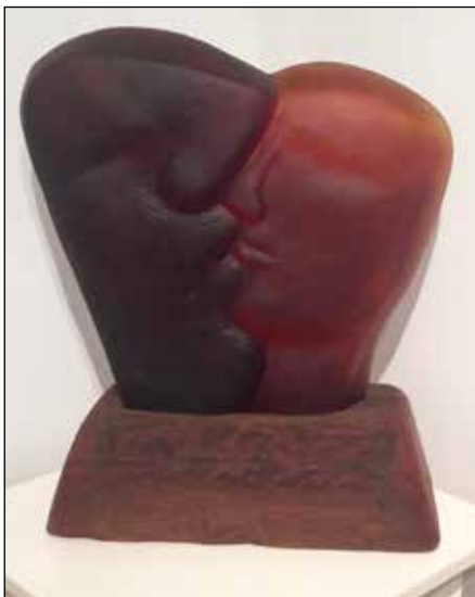
Sallie Portnoy: Tjungu (together in Pitinjara) kiln cast and engraved crystal

A number of our members are exhibiting their works at the Artists of Mosman 2088 Exhibition at Mosman Gallery. The show ends on March 20. Please remember to send us good images of your work if you want your work showcased in our Bulletin!