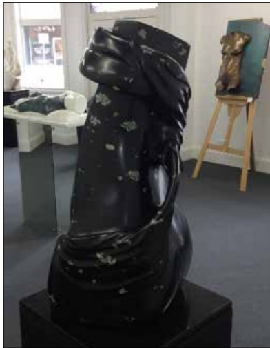
Roger McFarlane: Essence of Being Peony Granite from China The stone is very black with white flowers through it. It is a difficult stone to get hold of, and very hard to work. The sculpture is a very abstract and stylised female figure wrapped in a scarf.

"Dreamer" Patina Bronze inlayed into Carrara marble. The sculpture is on a mirrored plinth to give the appearance of floating.