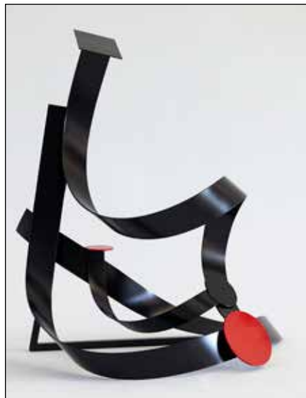
Jenny Green: Lyrical 1