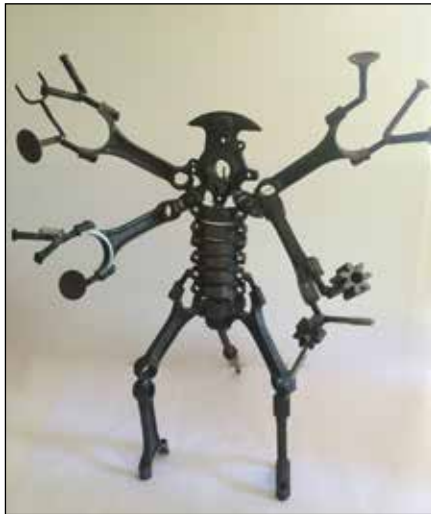
Willem van Stom: The First One Recycled Steel