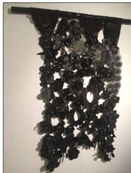
Caroline Rendle: Petal No.3 Antique lace, recycled PET bottles.