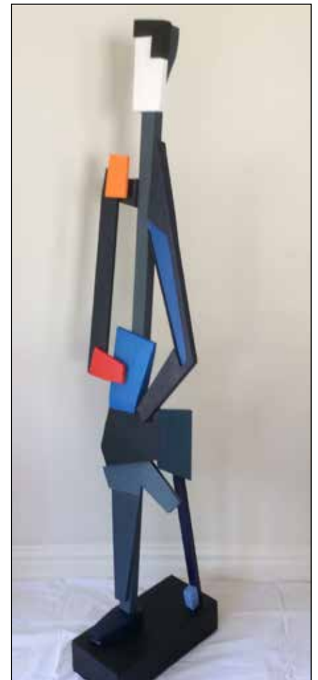
Roy Flor: Sheila 178 x 40cm Wood painted in acrylics

We hope to review the exhibition in the next issue of the Bulletin, if we have the space.