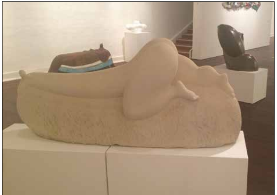
Vince Vozzo: Aphrodite Sandstone (1999)