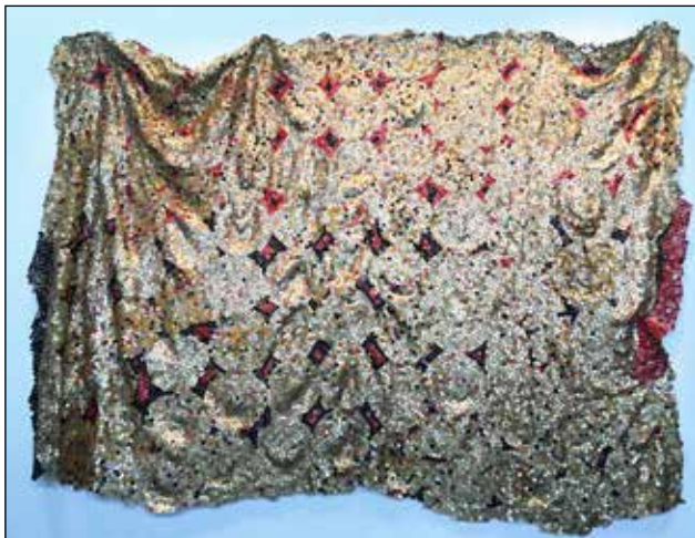
El Anatsui: Blema 2006 Found aluminium and copper wire