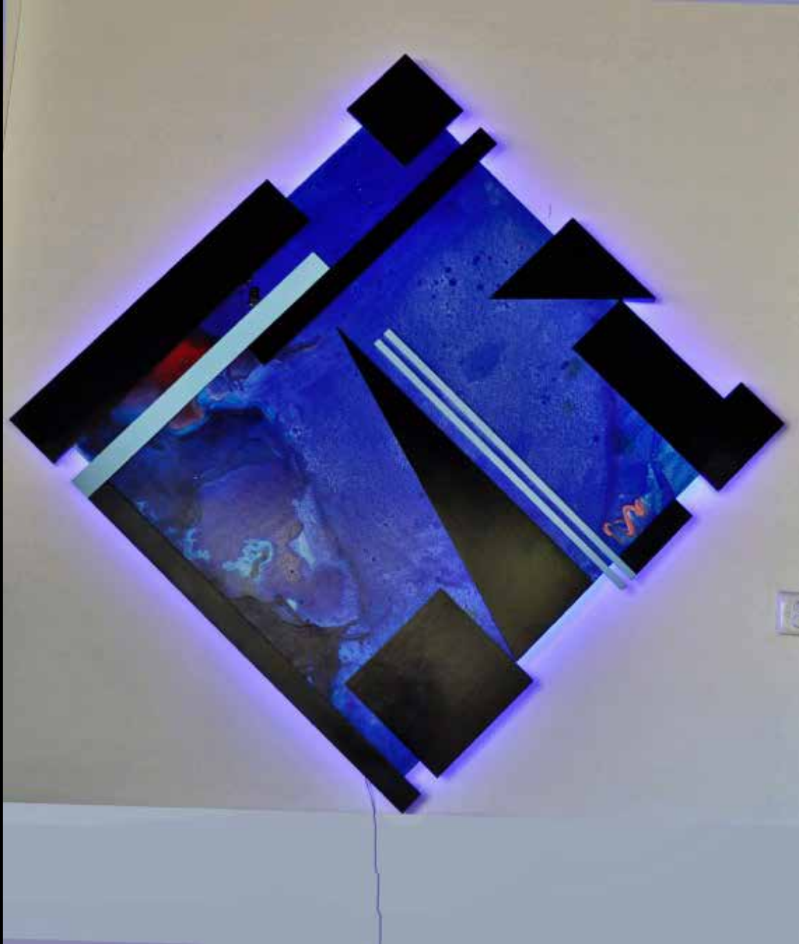
John Brooke Breakwater - acrylic and mixed media on board with LED lighting