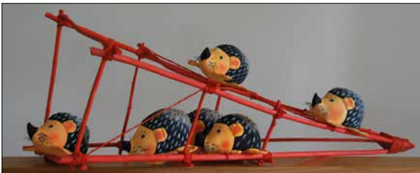
Lola Kaplan: Hedgehogs Pincushions Cotton, Acrylic paint. Incinerator Exhibition entry.