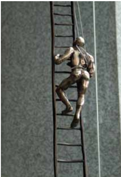
Angela Morrell: Ladder Theory Bronze 155x15x17cm