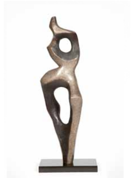
Jenny Green: The Dancer (Ed 5/9) Bronze, Granite 81x30x20cm