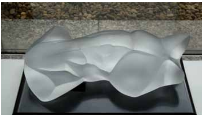
Peter Lewis: Decadence (Ed 1/10) Cast crystal glass, steel 15x40x25cm