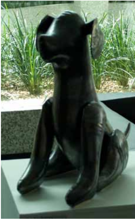
Petra Svoboda: Gokko-Inu (Make Believe Dog) (Ed 7/40) Ceramic 50x50x40cm