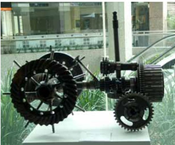
Willem van Stom: Tractor Carparts Photo: Eva Chant