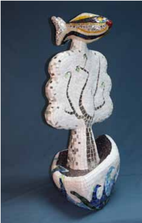
Sally Zylberberg: Life's Journey Smalti + Mirror tiles 86x56x35cm