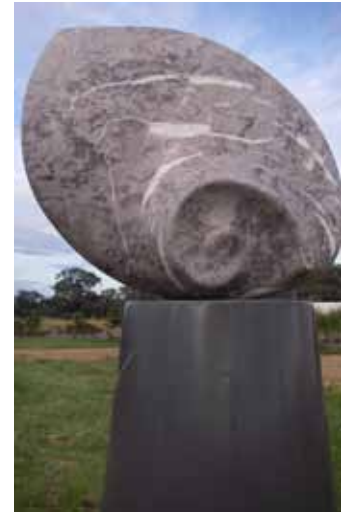
Senden Blackwood: Takana Limestone, steel 80x90x28