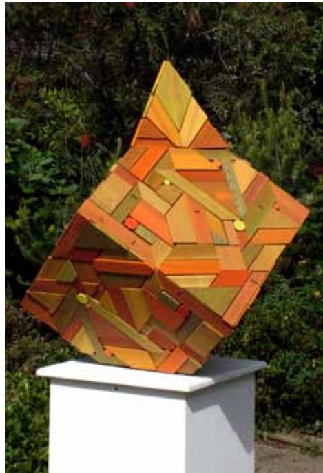
Ernie Gerzabek: Cube Variation #2 Recycled timber 75x66x79cm