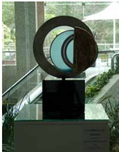
Fronsнова: Moon & Sun ii Bronze, stainless steel, glass, granite 45x30x7cm