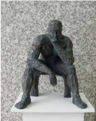
Feisal Ramadan: The Fireman Bronze, (ed 3/8) 45x40x40cm