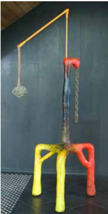
Wolfgang Gowin: Magpie Concrete, rope, steel, stone 213x104x69cm