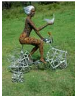
Paul Dimmer: Flower Power

If you are in vicinity of Central Coast drop into KASPE at Koondah Waters golf and spa resort at Koondah Boulevard (Off Pollock Ave), Wyong.