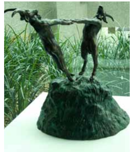
Kerry Cannon: Haystack Alpinas Bronze 33x35x24