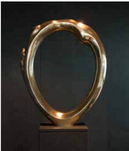
Helen Leete: Golden Oval Tantra Bronze 60x35x9cm