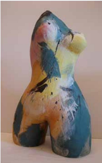
Feyona van Stom: Florence Ceramic 55x45x30cm