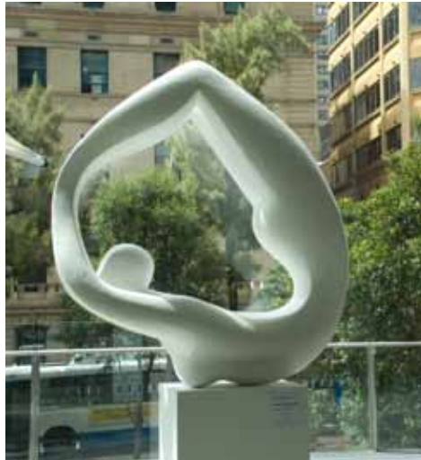
Larissa Smagarinsky: Movement (Ed 1/7) Cast Stone 100x100x50cm