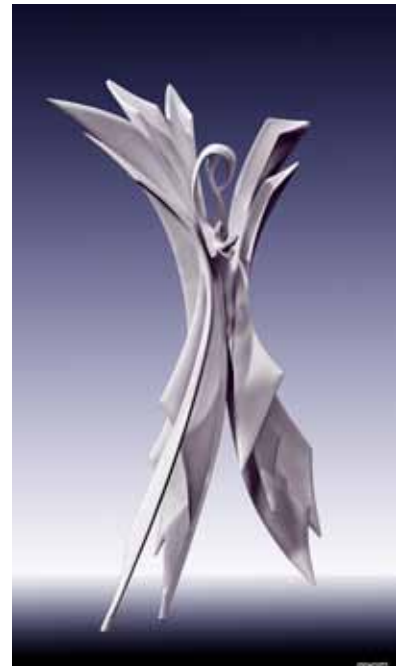
Terrance Plowright: Exploration of Elegance Stainless Steel 150x80x80cm