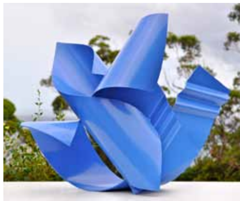
John Brooke: That's Why They Call It The Blues Steel 54x70x32cm